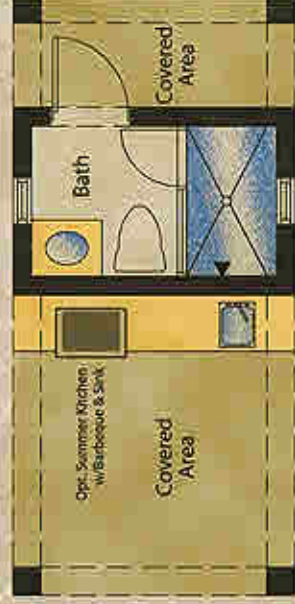
CABANA INCLUDED IN BASE PLAN

Placement of this Cabana will be subject to lot constraints