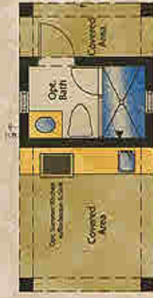
OPTIONAL CABANA Placement of this Cabana will be subject to lot constraints